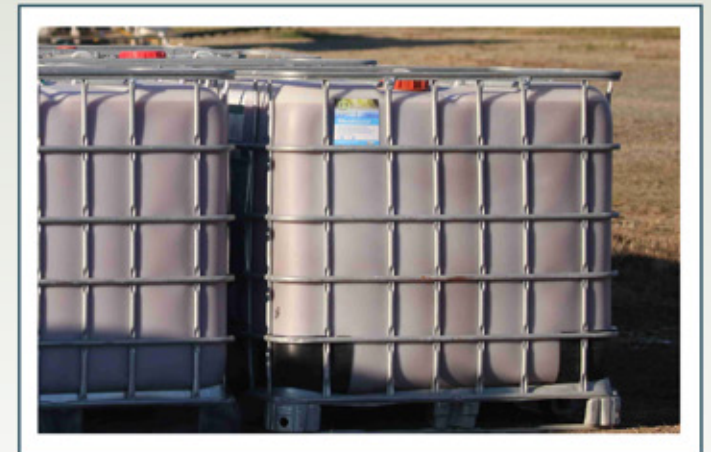
Multikraft Probiotic Solutions

Multikraft has decades of experience across the globe and has been actively helping Australian farmers since 2014. Their tailored solutions cover the plant and cropping, animal and environmental and waste sectors.