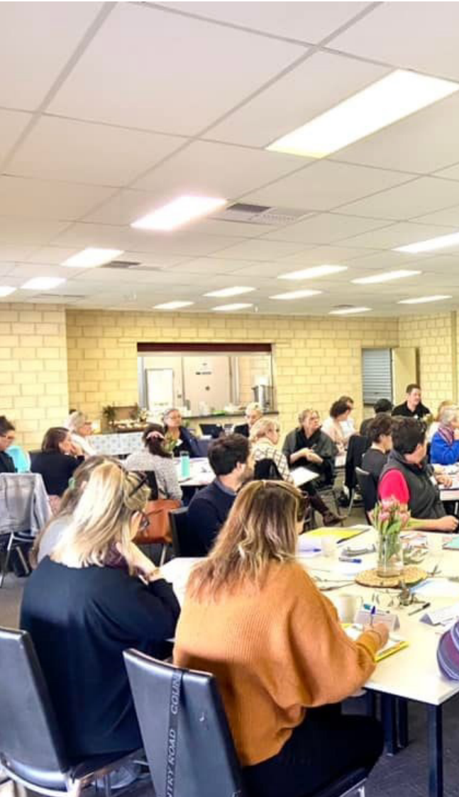
WA Cluster Muster