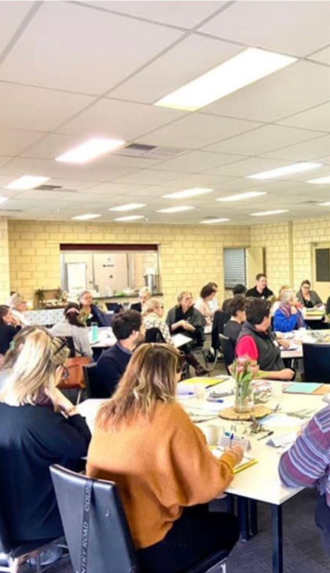
A Community Builders' 'Cluster Muster' workshop in West Australia