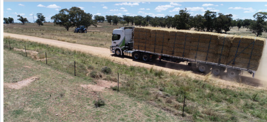
A hay drop on Queensland's Western Downs