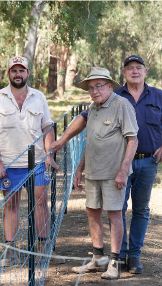
The Townsend family smile next to their new fence on their Eugowra property